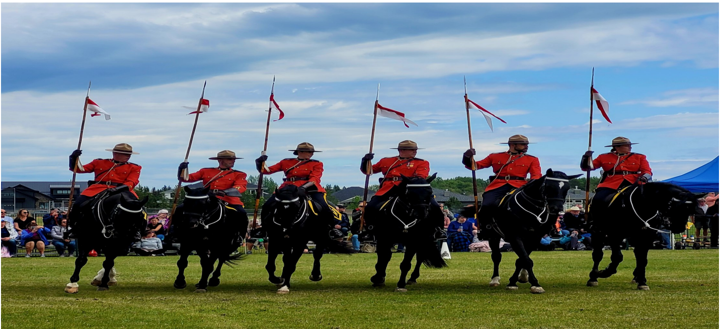
The RCMP Musical Ride was held in Ardrossan in June.

She said, "As we move forward into 2024 we will strive to achieve the goals and objectives set out by the committee, focusing on community crime prevention and awareness and recruitment of members to the Crime Watch program. We will continue to network and connect with community partners and like-minded groups."