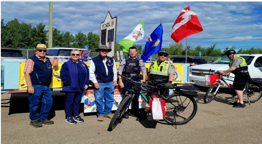
Members of the Strathcona County Crime Watch Association executive joined members of the Strathcona County RCMP and Enforcement Services at the Ardrossan Parade in June.

Looking ahead, the SCCWA president said the executive and members will continue to play a key role in crime prevention across Strathcona County.