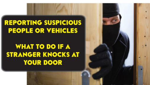
The front cover of our pamphlet

We continue to seek opportunities to educate the public about all forms of crime.