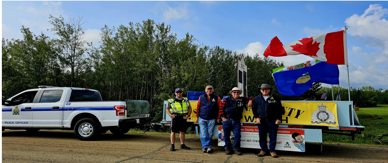
Members of the Strathcona County Crime Watch Association executive joined members of the Strathcona County RCMP and Enforcement Service at the South Cooking Lake Trail Days Parade in August.