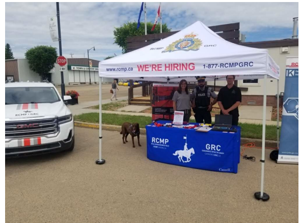
This event was held at the Killam RCMP Detachment. Many RCMP Units attended, as well as local Emergency Services and there was also a dunk tank!